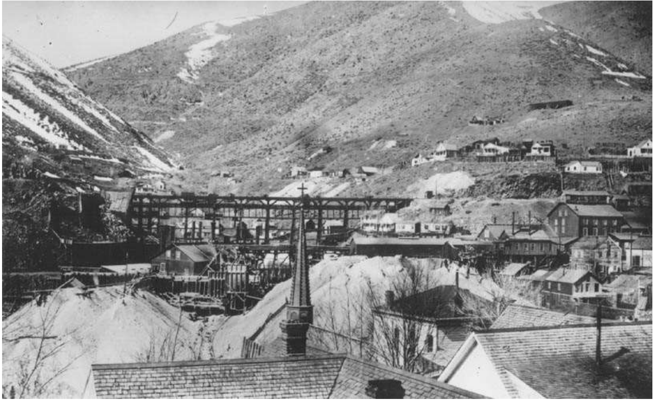
Crown Point Gulch about 1880 looking over the Gold Hill Hotel

Gold Hill was a working-class neighborhood with some of the most prosperous mines of the Comstock. The Crown Point Trestle, an engineering marvel, spanned a canyon for the Virginia and Truckee Railroad on its way to Virginia City.