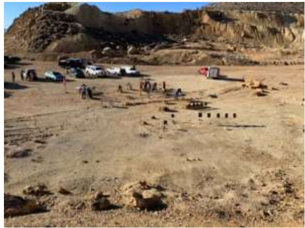
VIEW OF THE BONUS TARGET AND VIEW FROM THE BONUS TARGET