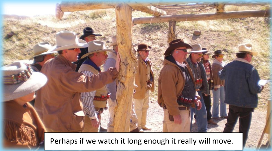
Perhaps if we watch it long enough it really will move.